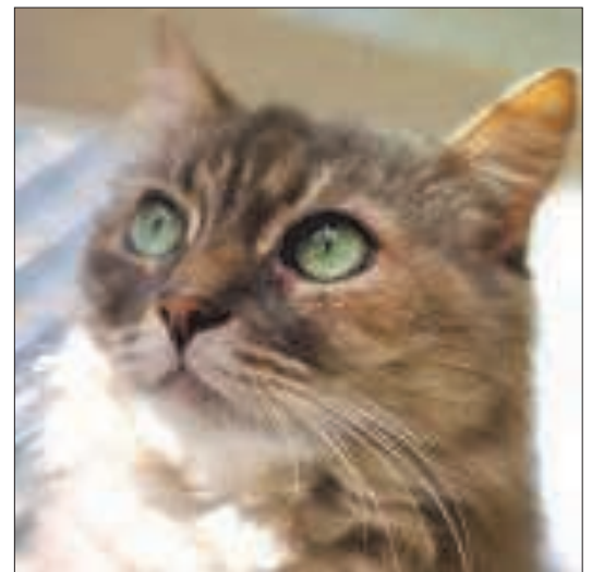
Bella simply needed the right person to come along and love her. Now she's Flourishing in her new home.

in now two shelters, she had the right to be choosy. It turns out Grizzabella had the last laugh: her new home calls her Bella and she has kitty beds spread around the house so she can follow the sun to her heart's delight. And, she's the only pet in the home so she gets all the love to herself – just the way she always wanted it!