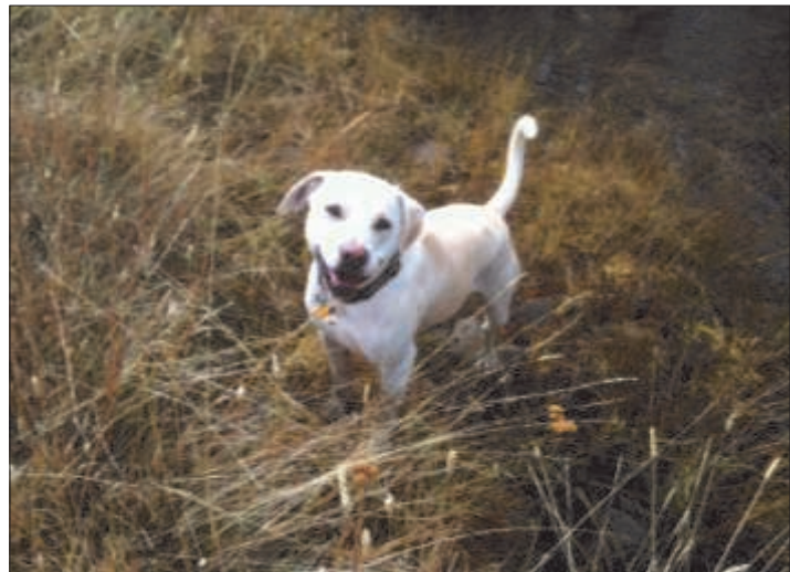
After weeks on the run, Sawyer finally settled down into a life full of walks, fun and love.

Often we have no clue as to an animal's history and such was the case with Sawyer. He was left at another shelter and was so fearful he would barely walk. With a little work he started coming around, but this shelter is a busy one and Sawyer was scheduled to be put down. The staff had worked so hard with him, so they convinced me to take him to our shelter. His first few hours with us set him back, and we weren't able to get a collar and tag on him. The very next day, in the space of just a few minutes, he chewed his way out of a wire pen and was gone. For five weeks! In fact, he hadn't been named until he took off for the river and so became "Tom" Sawyer. We guess he finally got tired of life on the lam, and on Labor Day, with many packs of hot dogs, Sawyer was recaptured! His socialization was slow, but steady and after some time found him a foster home where he could continue his progress. Sure enough, one day the foster just couldn't bring him to any more adoption days and we chalked up another "failed foster" to our list!