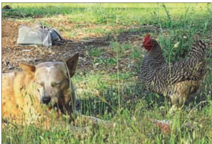
A cat-free home is paying off for Red. Now he gets to spend time on a farm surrounded by friendly chickens.

Red was originally picked up as a stray, so his history was unknown to us. Because he was an older boy it took a few months to find him a home, but he found a great one! Until he started showing pretty severe dog aggression and was returned several months later. As much as Red didn't seem to like dogs, he really had it out for cats. Obsessed would be a polite way of putting it. So we went to work on desensitizing him to other dogs over the next six months that it took to find him a new home. By the time he left us, he could easily be in a group of five to six other dogs with no issues. He still was obsessed with cats, but his new owner didn't have any. She did have chick-